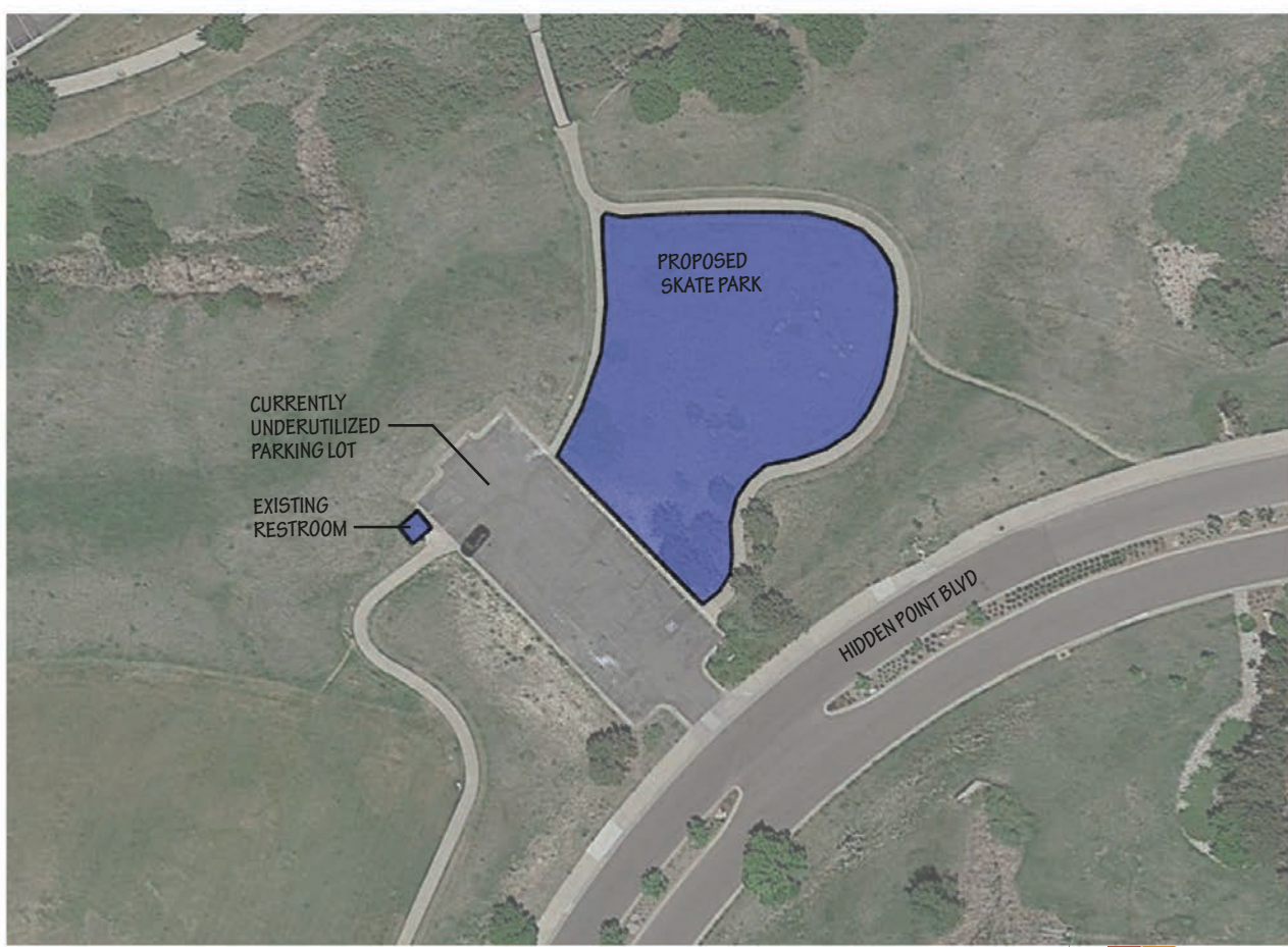
Closer Perspective of CPNMD's Proposed New Skate Park Location in Coyote Ridge Park November 2022