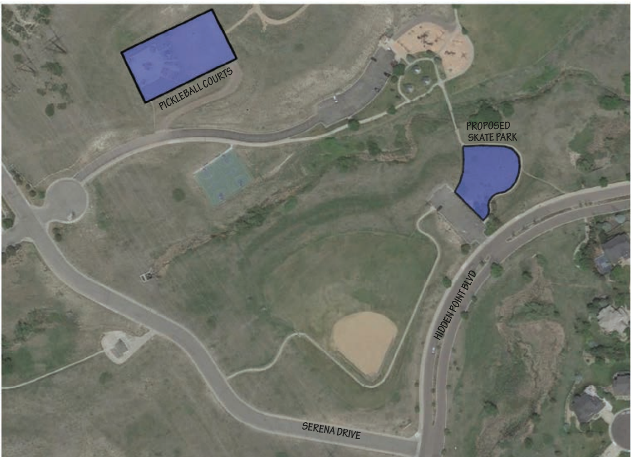
CPNMD's Proposed New Skate Park Location in Coyote Ridge Park with Adjacent Streets November 2022