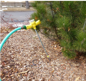
DEEP ROOT NEEDLE (2 GPM)