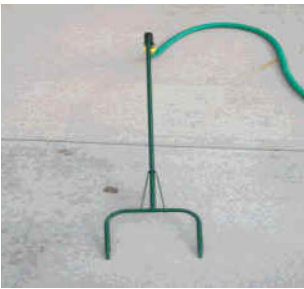
DEEP ROOT FORK (2 GPM)