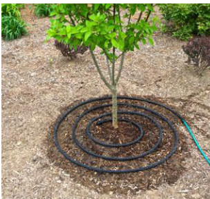
SOAKER HOSE (2 GPM) (50 feet with restrictor)