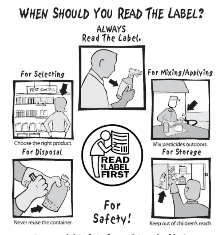
The pesticide label provides vital info about the safe use of a pesticide.