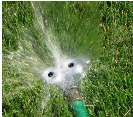
Hose with sprinkler attachment