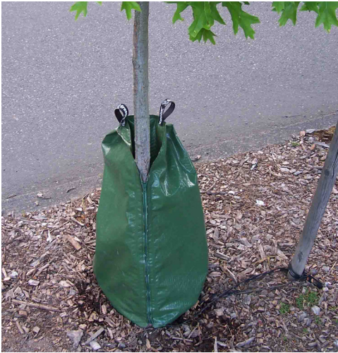
Tree watering bag (20 gallon)