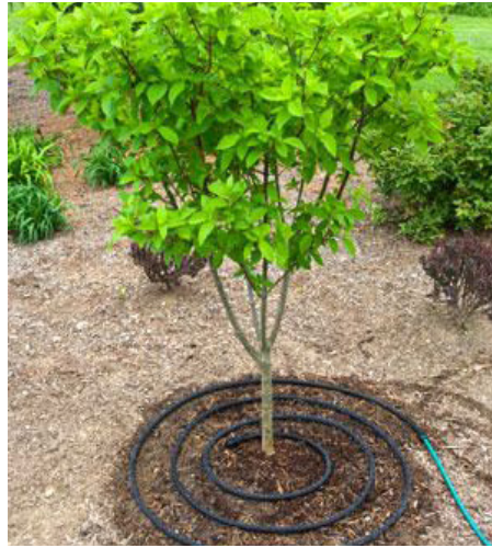
Soaker hose method