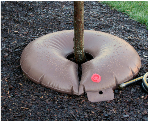
Tree watering bag (14 gallon)