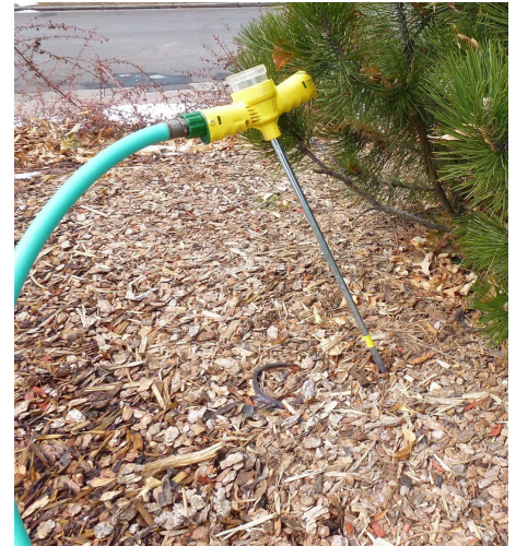
Hose with soil needle