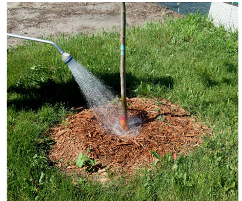
Hose with watering wand